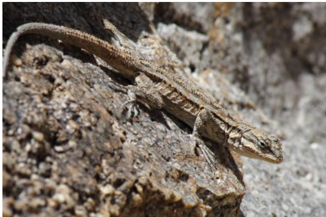
Ornate Tree Lizard

find support for any of the three hypotheses, but more data need to be collected on non-territorial males and overall host density (including other lizard species in the area) before reaching more definitive conclusions about the effects of throat colour and population density on parasite load.