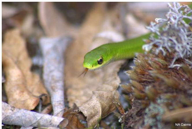
Smooth Greensnake

that our cover objects provide. Dan is now preparing to begin radio-telemetry work on skinks and assessing current habitat quality of historical skink locations in the Carolinian zone.