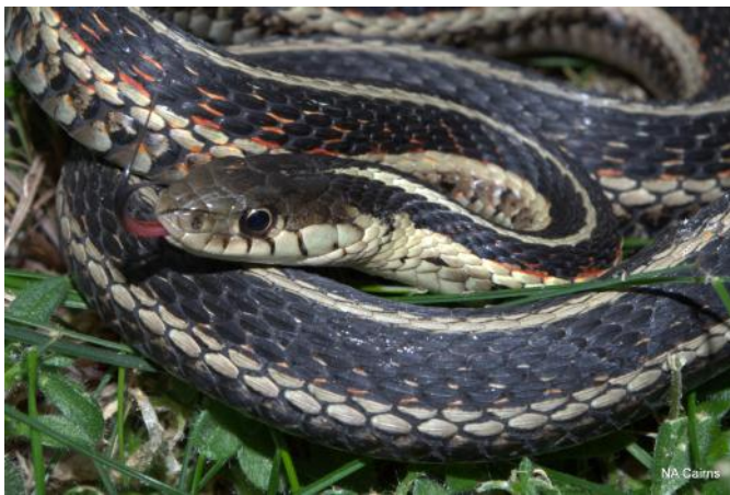
Red-sided Gartersnake