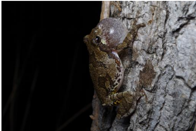
Grey Treefrog

I hope you enjoy this spring 2015 issue of TCH!