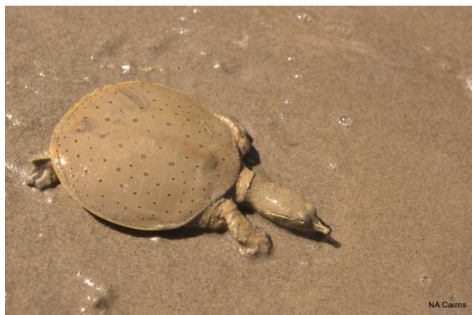
Spiny Softshell

patterns reflective of different environments. Few studies have examined variation in somatic growth rate across the Wood Turtle's geographic range, and to date no studies have quantified somatic growth for the Sudbury District population, located near the species' northern range limit. The objectives of this study were to quantify somatic growth in the Sudbury population, and to determine if the observed geographic variation in body size was the result of inter-population variation in somatic growth rates. In the Sudbury population, males grew faster than females during early life history stages, and overall grew to larger mean carapace lengths than females. The most significant variation in somatic growth increments occurred as the turtles approach maturity, at which point energy resources are reallocated to reproduction. Across the geographic range, populations at southern extremes had higher somatic growth rates, grew to smaller mean carapace lengths, and attained sexual maturity earlier than those at the northern extremes; this pattern was related to the number of frost-free days and mean active and annual temperatures. Understanding variation in species' life history traits is critical to understanding changes in population demography, which is important when managing populations that are in decline.