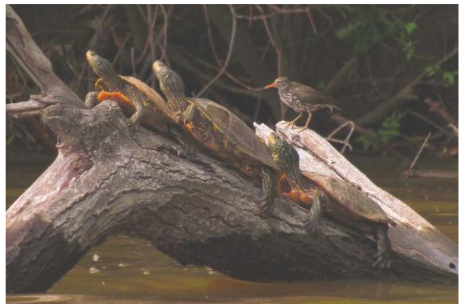
Map Turtles and Spotted Sandpiper in Carroll's Bay.

Here, I offer a hypothesis to explain the absence or scarcity of Map Turtles in sections of the Grand River upstream from Paris: Shallow water in a stream with gradients that produce riffles and rapids acts as a barrier to the upstream movement of Map Turtles. Such conditions are common between Cambridge and Paris, where I found few Map Turtles. To support this hypothesis, Map Turtles also appear to be scarce or absent upstream from the relatively quiet, deeper waters of rivers flowing into Lake Ontario. For example, where the Credit River and the Humber River become too shallow to be navigated by kayak, where rapids are present and where stony substrate is close to the water surface, Map Turtles appear to be absent. They also appear to be absent further upstream in the Credit and Humber Rivers, despite the availability of deeper, quieter waters in some upstream sections. I am aware that there have been sightings of Map Turtles upstream from Cambridge on the Grand River. My observations suggest however, that this species is likely uncommon in these upstream areas, perhaps because of the reason indicated above.