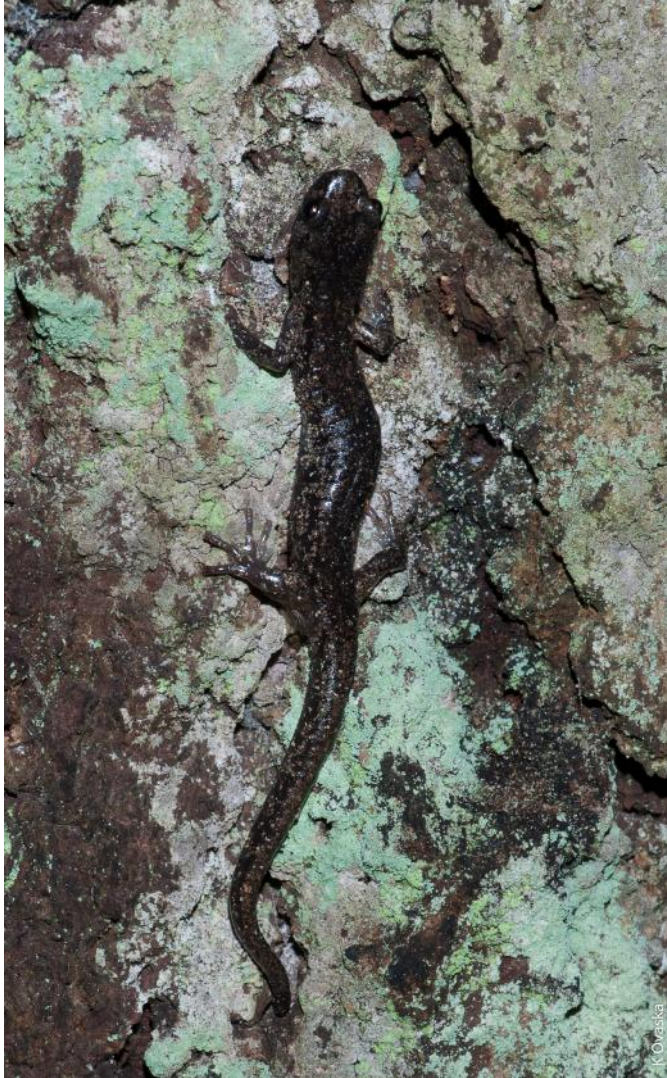
Wandering Salamander

2014. This species has a curious disjunct distribution and occurs on Vancouver Island, BC, and in northern California; various hypotheses ranging from drafting on ocean currents to introductions within historical times have been proposed as explanations for this pattern. Wandering Salamanders are almost invariably found in association with moderately decayed wood and are also known to climb trees. One individual was spotted in the lofty height of 57 m in a large Sitka Spruce on the west coast of Vancouver Island!