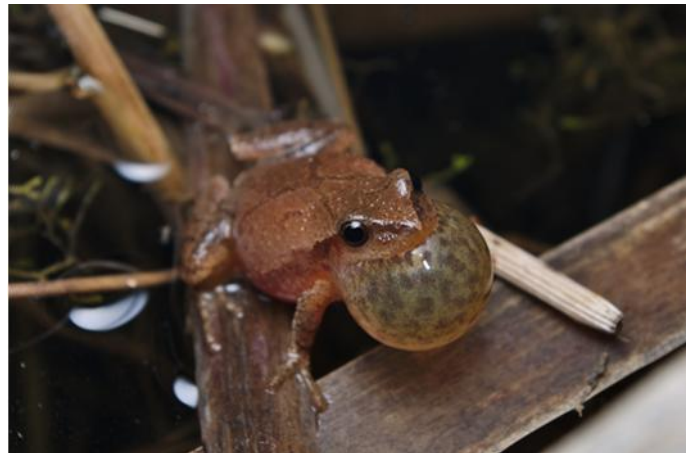
Spring Peeper

Are you warm, yet? This past winter was a doozy, from record cold to record snowfalls. But that's all behind us now. Spring has sprung, and there is herping to be done!