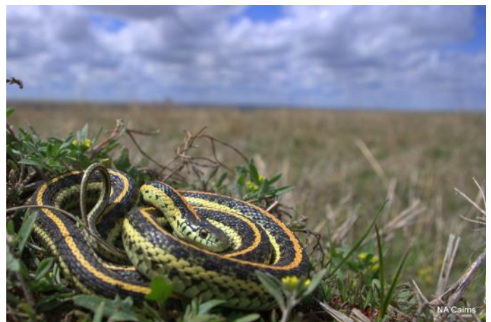
Plains Gartersnake

Kiyoshi Sasaki (Post doc) - Impact assessment and development of ecological restoration strategies for reptiles and amphibians inhabiting mining-disturbed environments.