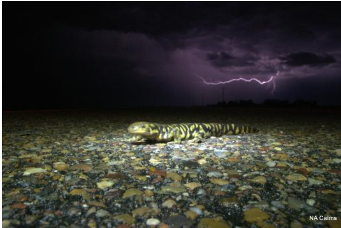
Tiger Salamander on a stormy night